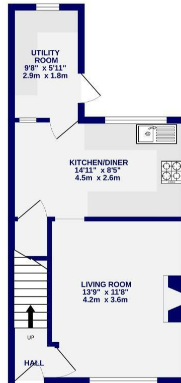
GROUND FLOOR 381 sq.ft. (35.4 sq.m.) approx.